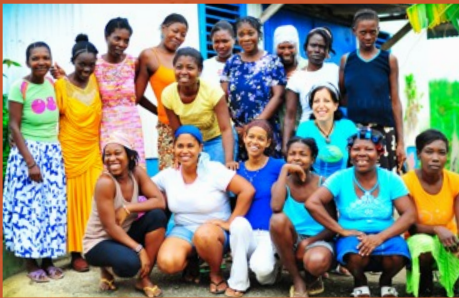
These are only 17 of the 30 people receiving employment from La Tienda (it was hard to get everyone out for picture day).